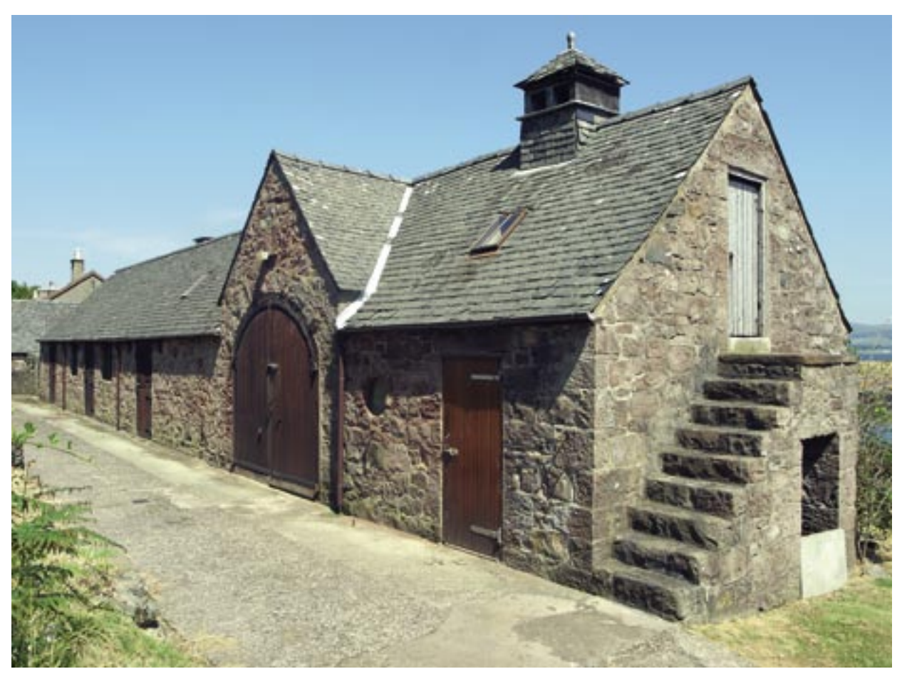
The Old Byre

Stone jetty providing small boat access at high and low tides.