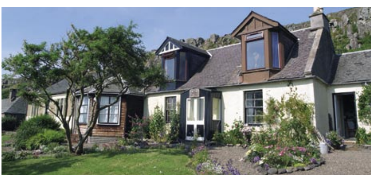
The Old Garden Cottage and Bothy