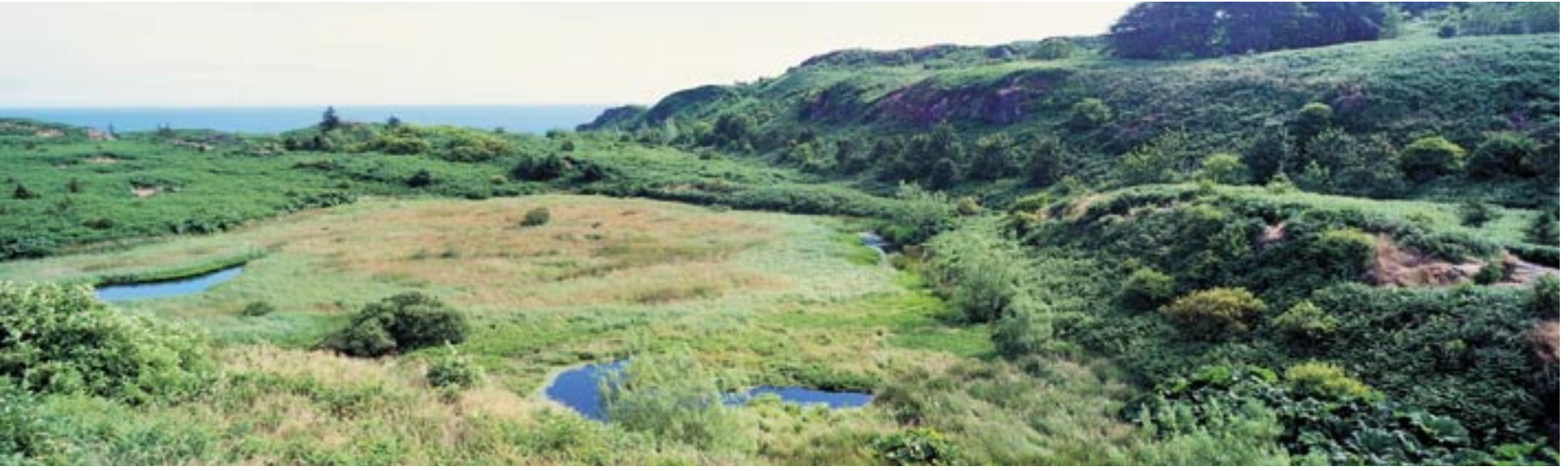
Site of proposed planning application for lodge development